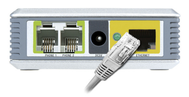
Figure 3-3: Connect the Ethernet Network Cable

The installation of the Phone Adapter is complete. Now you can pick up your phone and make calls.