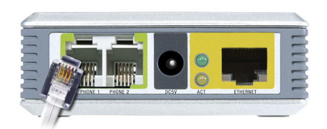
Figure 3-2: Connect the RJ-11 Telephone Cable

IMPORTANT: Do not connect either of the Phone ports to a telephone wall jack. Make sure you only connect a telephone or fax machine to either of the Phone ports. Otherwise, the Phone Adapter or the telephone wiring in your home or office may be damaged.