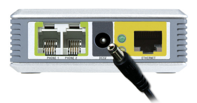
Figure 3-4: Connect the Power Adapter