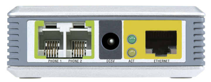
Figure 2-1: Back Panel

The Phone Adapter's ports and LEDs are located on the back panel.